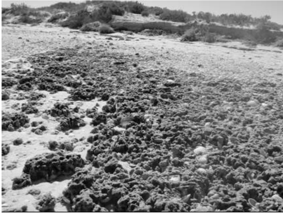
Figure 2. Pro-thrombolitic extension in Laguna San Ignacio.