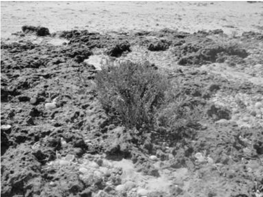
Figure 3. Pro-thrombolitic formation showing a fixed xerophytic plant.