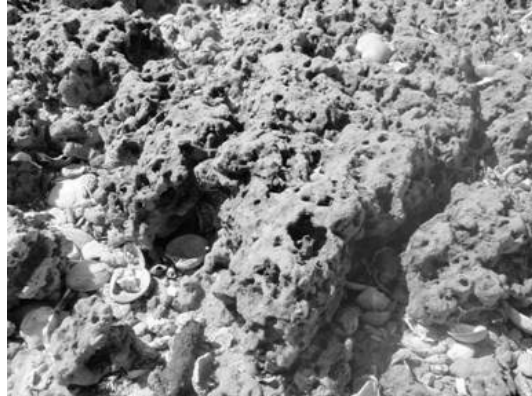
Figure 4. Shell accumulations trapped inside the conglomerates.